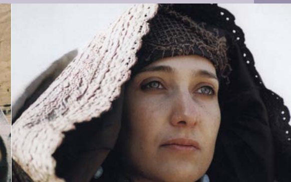
THE BEAUTY ACADEMY OF KABUL