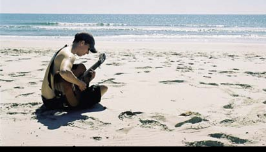
VIEW FROM A GRAIN OF SAND